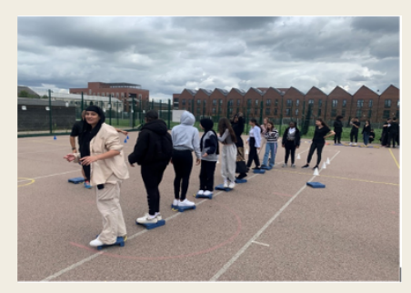
Six form students participating in teamwork activities.

In September 2023 we were pleased to welcome the very first cohort of sixth form students into Heron Hall Academy. This is a landmark occasion for the school and allows us to continue the fantastic work from KS4 and GCSE into KS5 and A-Levels.