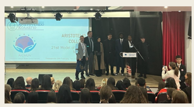
HHA sixth formers collecting their certificates of attendance and participation to the MUN!