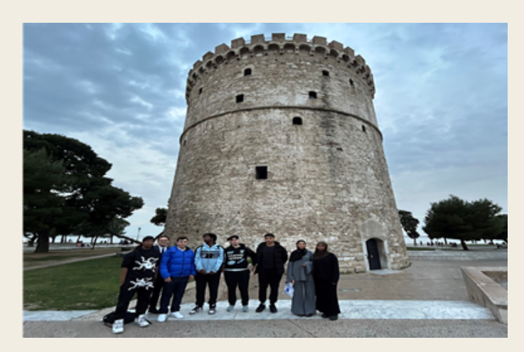
This is the White Tower – another fortress and last used as a prison up until the 19C