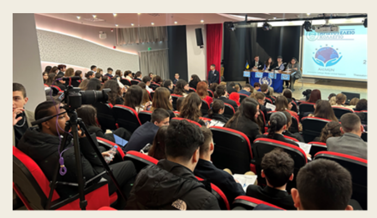
3rd day of the conference with the final speeches from all the countries – HHA sixth formers listening