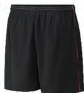
Shorts (Black with red stripe)