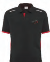
Polo Shirt (Black)