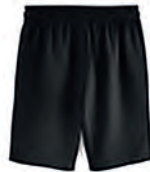
Shorts Plain Black