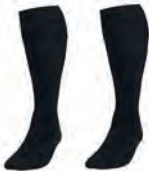
Socks Plain Black

All students MUST wear astro trainers during PE lessons on the astro pitch. These can be purchased at the uniform shop or other sports clothing outlets. Pupils will not be allowed on the astro pitch in normal trainers.