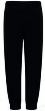
Tracksuit Bottoms Plain Black